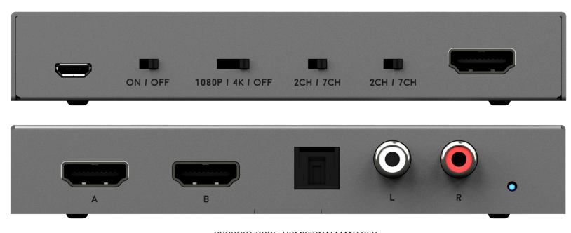
PRODUCT CODE: HDMISIGNALMANAGER